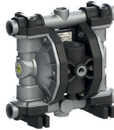
ALU (P 100)