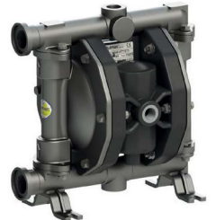
SS (P 100)